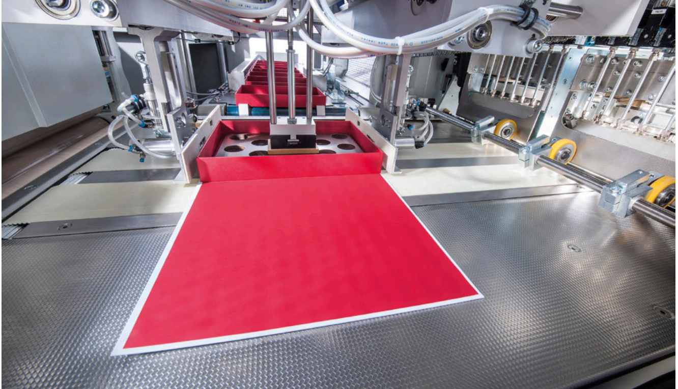
Placing module for boxes, type Box Placer BP 500