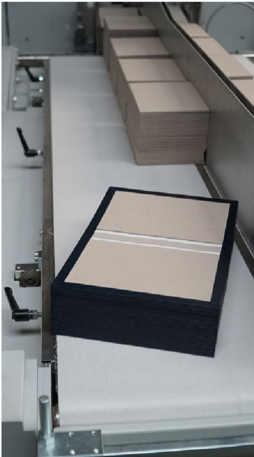
View of the cardboard feeder. The machine can also process very thin cardboard. In the foreground, finished book covers from current production.

cover books can also be binders, folders, calendars, cardboard boxes or games - in short, anything where grey cardboard is laminated with printed paper and high quality is important. It incorporates proven Kolbus engineering expertise and manufacturing quality. The machine also has a high degree of automation and is easy to operate thanks to its well thought-out ergonomics. This allows for very short set-up times and quick job changes, which are increasingly in demand today.